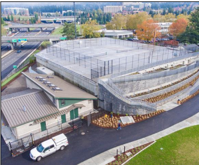
Ridgewood View Park Reservoir

TVWD's six departments consist of Administrative Services, Engineering and Operations, Water Supply Program, Customer Service, Finance, and IT Services. The District employs approximately 132 full-time, non-union employees and operates on a 2017-2019 budget of $265 million. TVWD is governed by a five-member Board of Commissioners elected at large to four-year overlapping terms by District voters. The Board of Commissioners, with guidance from TVWD staff, is responsible for developing policies and procedures to improve TVWD services. TVWD is a self-sustaining water utility that does not receive any tax dollars. All revenue collected is spent on District operations, infrastructure projects, and system maintenance.